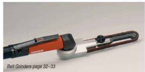
Belt Grinders page 32-33