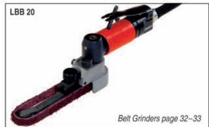
Belt Grinders page 32–33